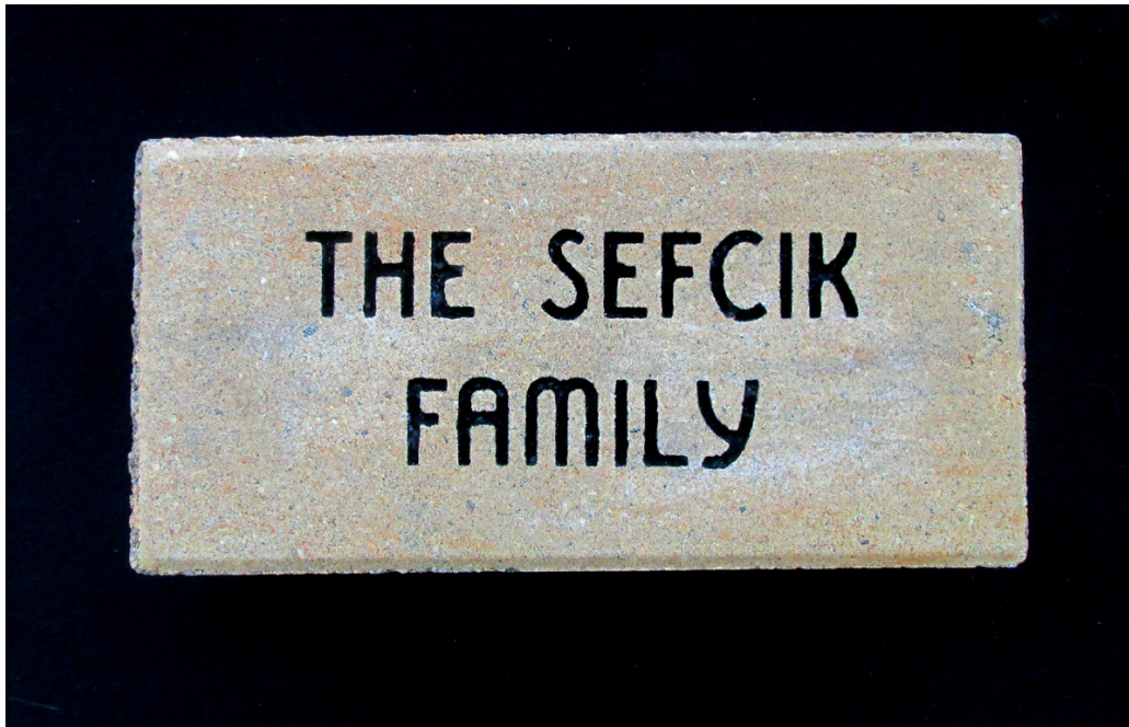
Sample of 8" x 8" Engraved Brick Paver